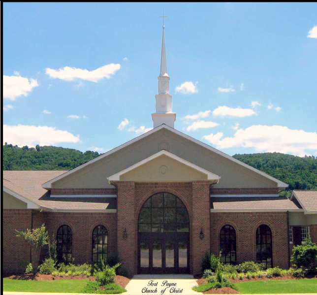
Fort Payne Church of Christ