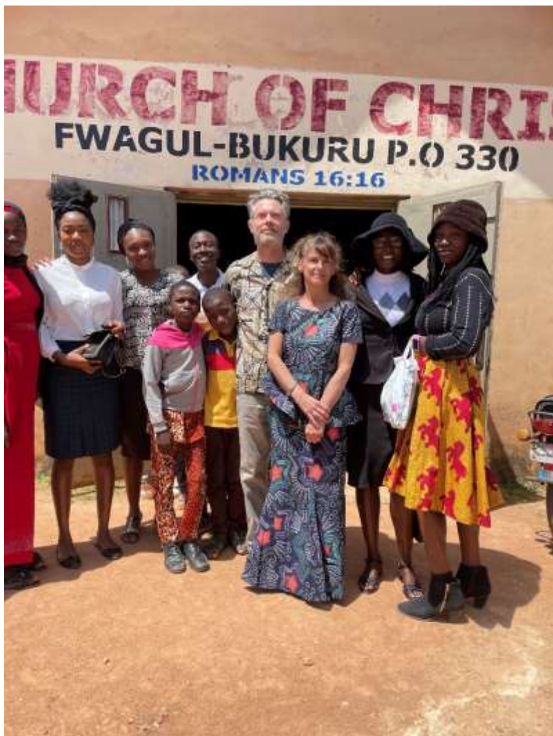
Here we are with a few of the Bukuru brethren