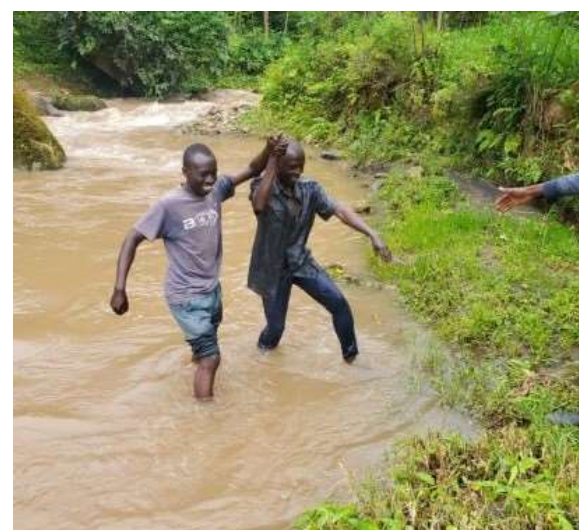
"...and they came up out of the water..."