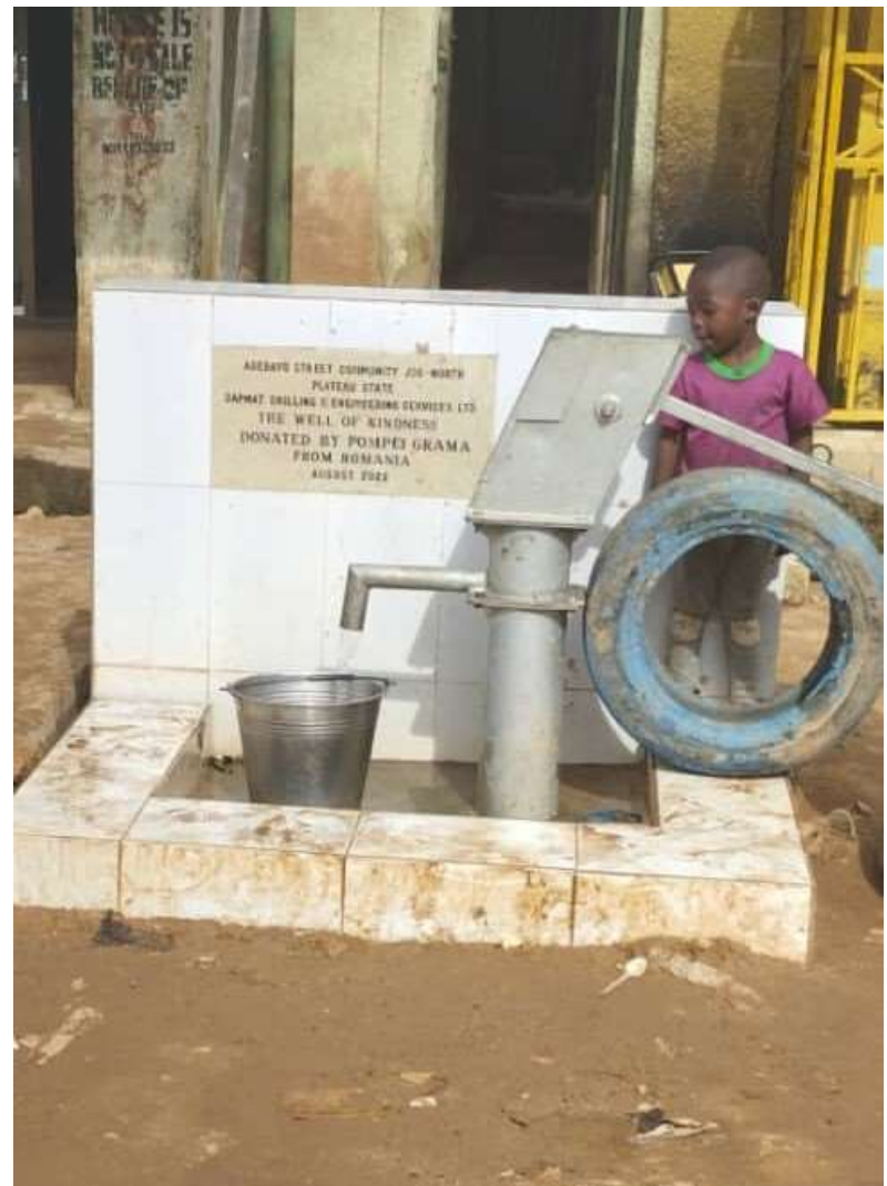
An example borehole. This one has a manual hand pump. It is our hope we have sufficient funds to install an electric pump and a 5000 liter tank at each site.

"And in every work that he began in the service of the house of God, in the law and in the commandment, to seek his God, he did it with all his heart. So he prospered." (2 Chr. 31:21)