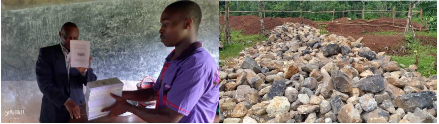
Bududa church receiving new song books in local language No earth moving equipment here ... all manual labor