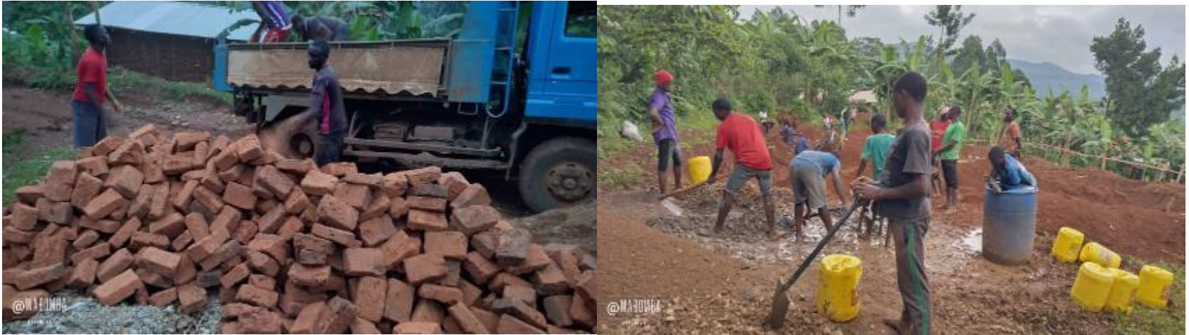
Community work on church building