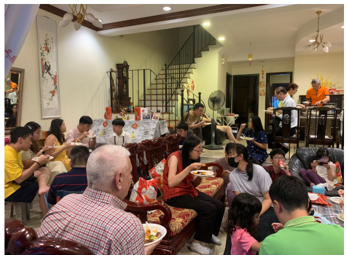
Visit at the Cheong's