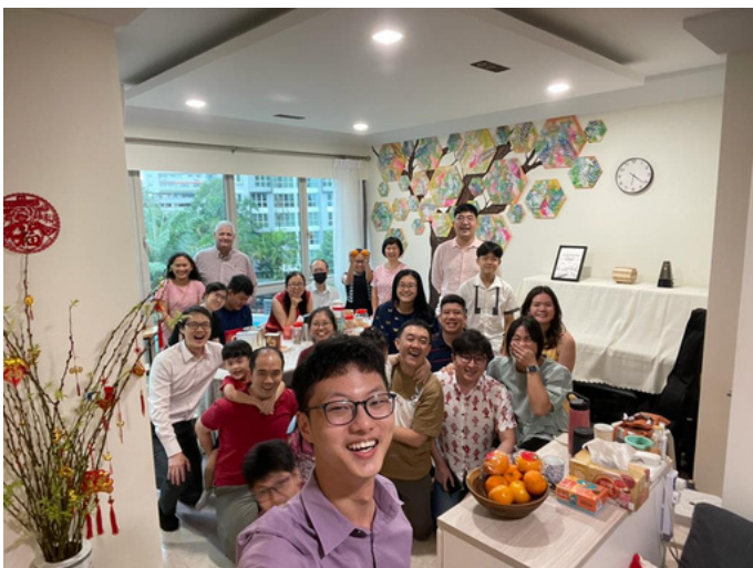
Visit at the Quek's