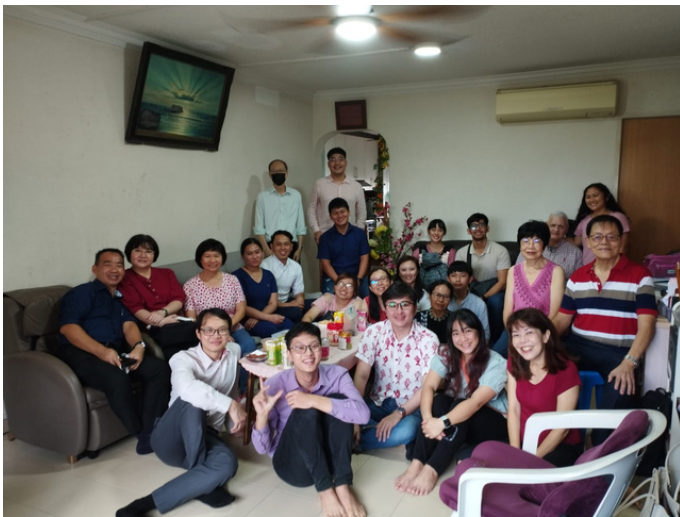
Visit at the Ee's

We concluded this month at FSC with Mid Term tests on January 30 and 31.