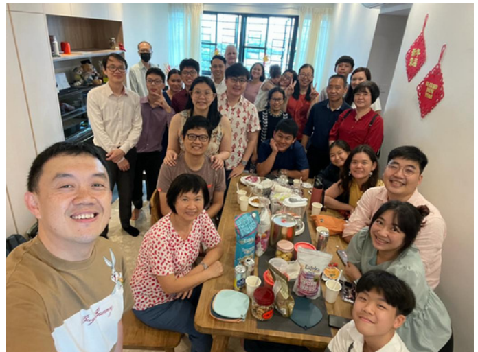
Visit at the Young's